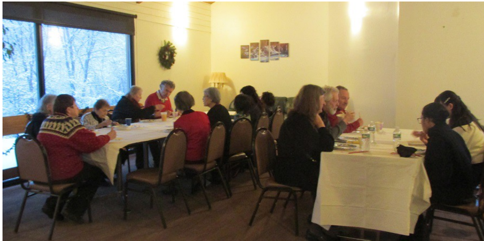
(Enjoying food and conversation)